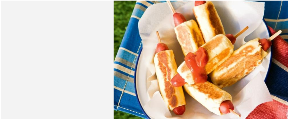
Frankfurts in damper.

Camping and frankfurts go hand in hand, but this twist on it makes it even better. The kids are sure to enjoy this easy camping recipe!