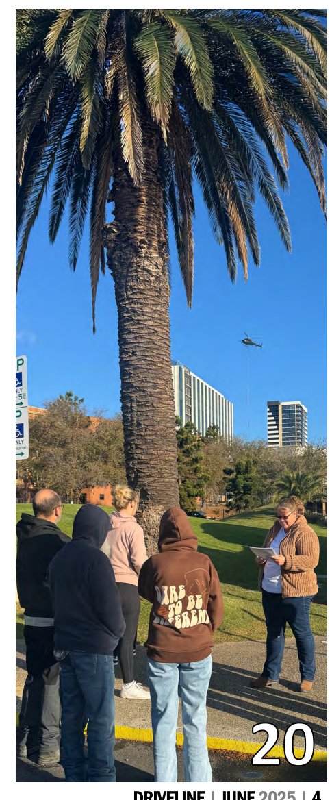
DRIVELINE | JUNE 2025 | 4