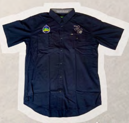
DRESS SHIRT $65