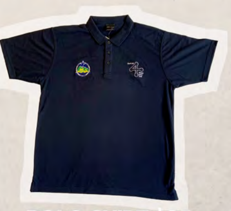
POLO SHIRT $35