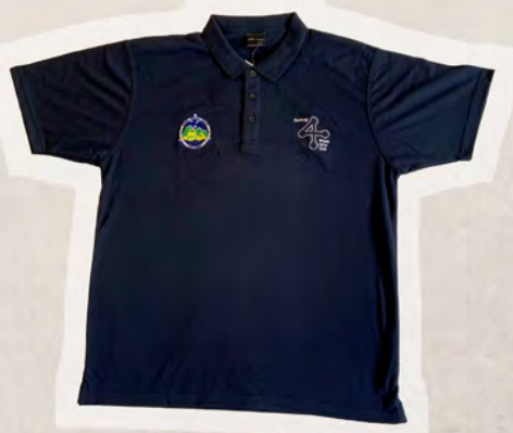
POLO SHIRT $35

POP IN AND TRY YOUR SIZE - IN NAVY BLUE ONLY. SHOW YOUR CLUB ID & PLACE YOUR ORDER. PRICES INCLUDE ALL EMBROIDERY.