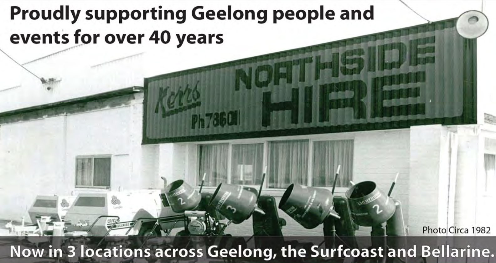
Photo Circa 1982

Proudly supporting Geelong people and events for over 40 years