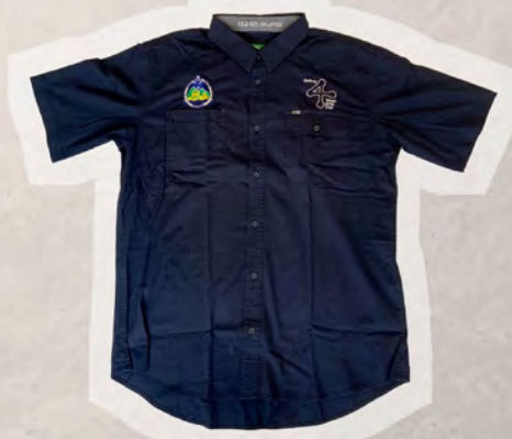
DRESS SHIRT $65