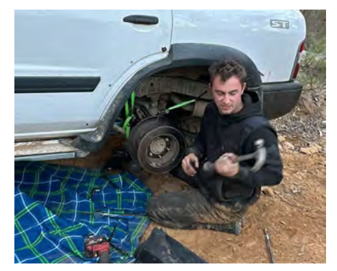
DRIVELINE | JULY 2024 | 31