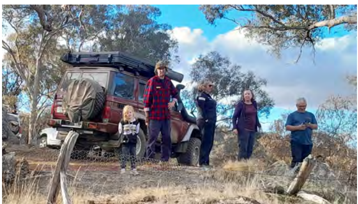
DRIVELINE | JULY 2024 | 28