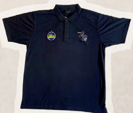
POLO SHIRT $35

POP IN AND TRY YOUR SIZE - IN NAVY BLUE ONLY. SHOW YOUR CLUB ID & PLACE YOUR ORDER. PRICES INCLUDE ALL EMBROIDERY.