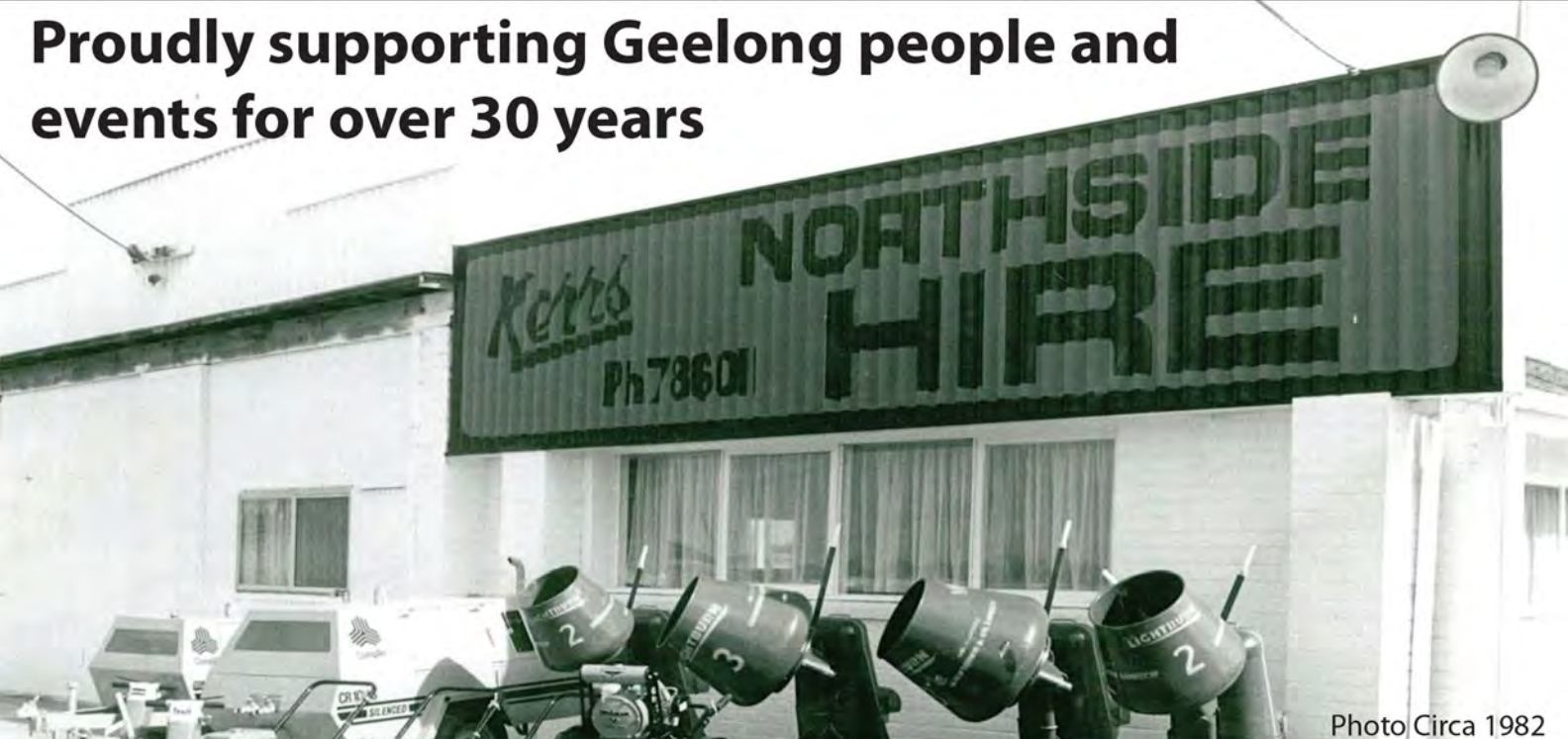
Photo Circa 1982

Proudly supporting Geelong people and events for over 30 years