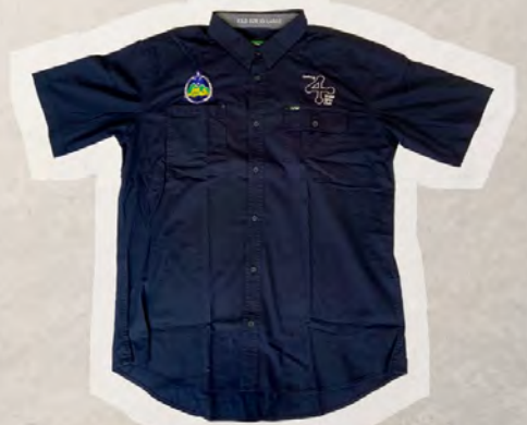
DRESS SHIRT $65