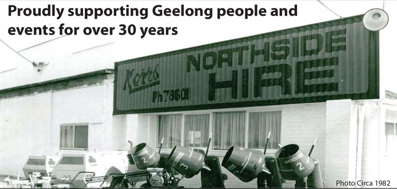
Photo Circa 1982

Proudly supporting Geelong people and events for over 30 years