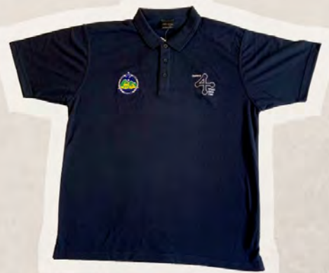
POLO SHIRT $35

POP IN AND TRY YOUR SIZE - IN NAVY BLUE ONLY. SHOW YOUR CLUB ID & PLACE YOUR ORDER. PRICES INCLUDE ALL EMBROIDERY.