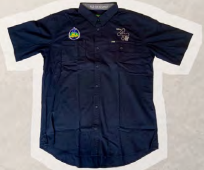
DRESS SHIRT $65