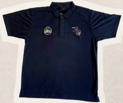
POLO SHIRT $35