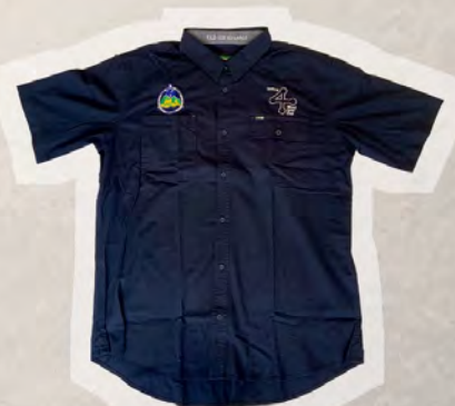
DRESS SHIRT $65