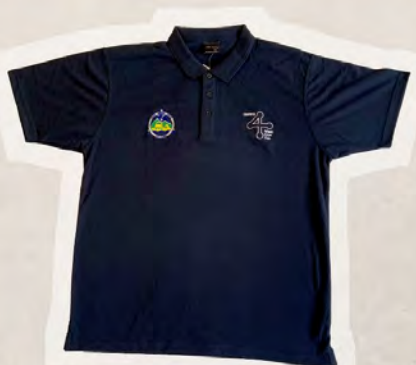
POLO SHIRT $35