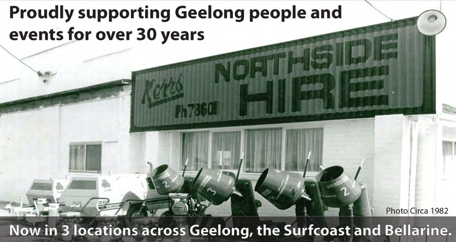
Photo Circa 1982

Proudly supporting Geelong people and events for over 30 years