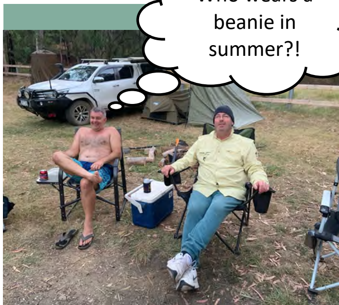
Last Month's Winning Entry