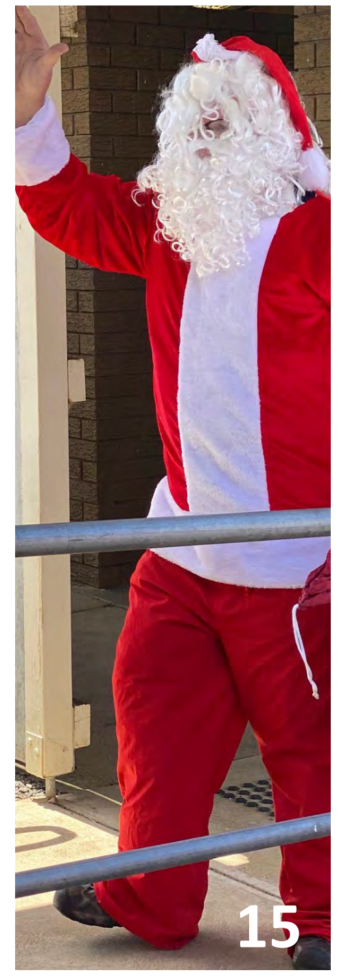
DRIVELINE | FEBRUARY 2021 | 4