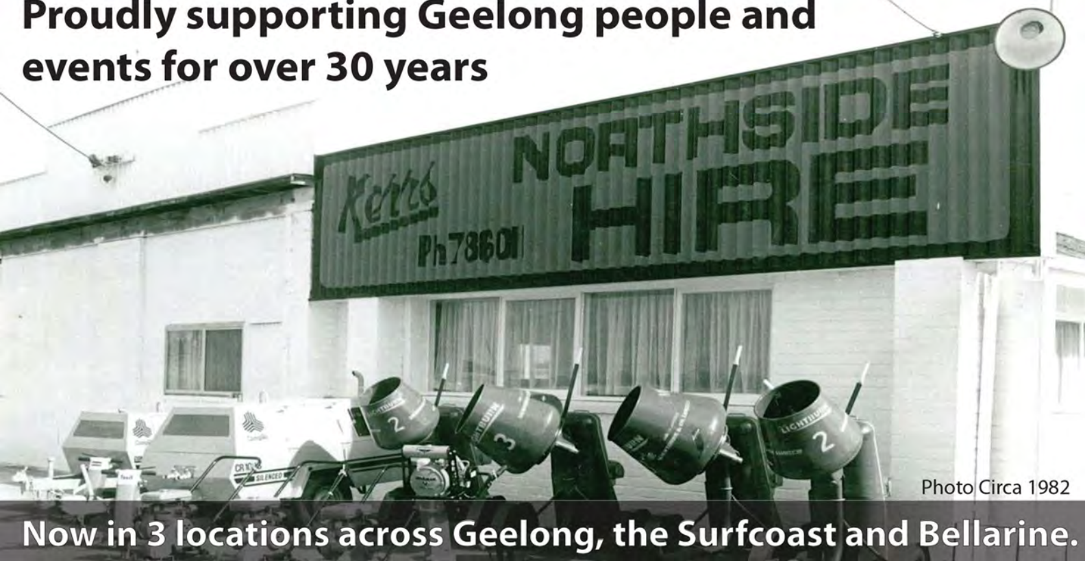
Photo Circa 1982

Proudly supporting Geelong people and events for over 30 years