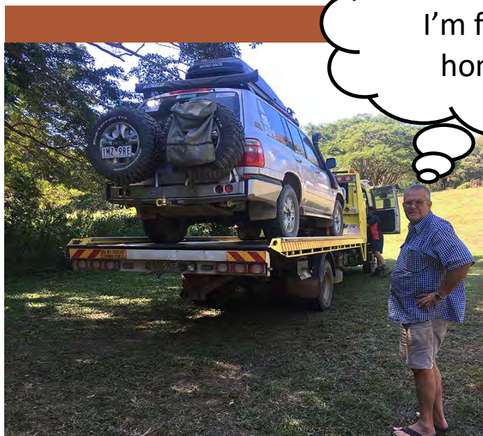
Last Month's Winning Entry