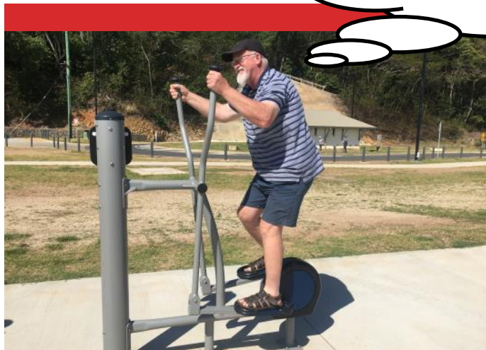
Last Month's Winning Entry