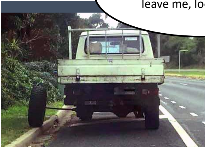
Last Month's Winning Entry

You picked a fine time to leave me, loose wheel.