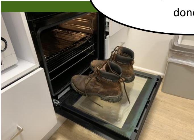
Last Month's Winning Entry

How do like you like your boots, medium or well done ?