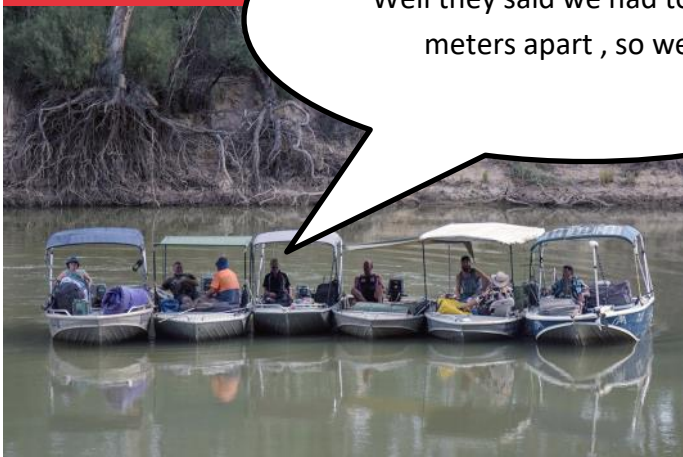
Last Month's Winning Entry

Well they said we had to stay 1.5 meters apart , so we are.