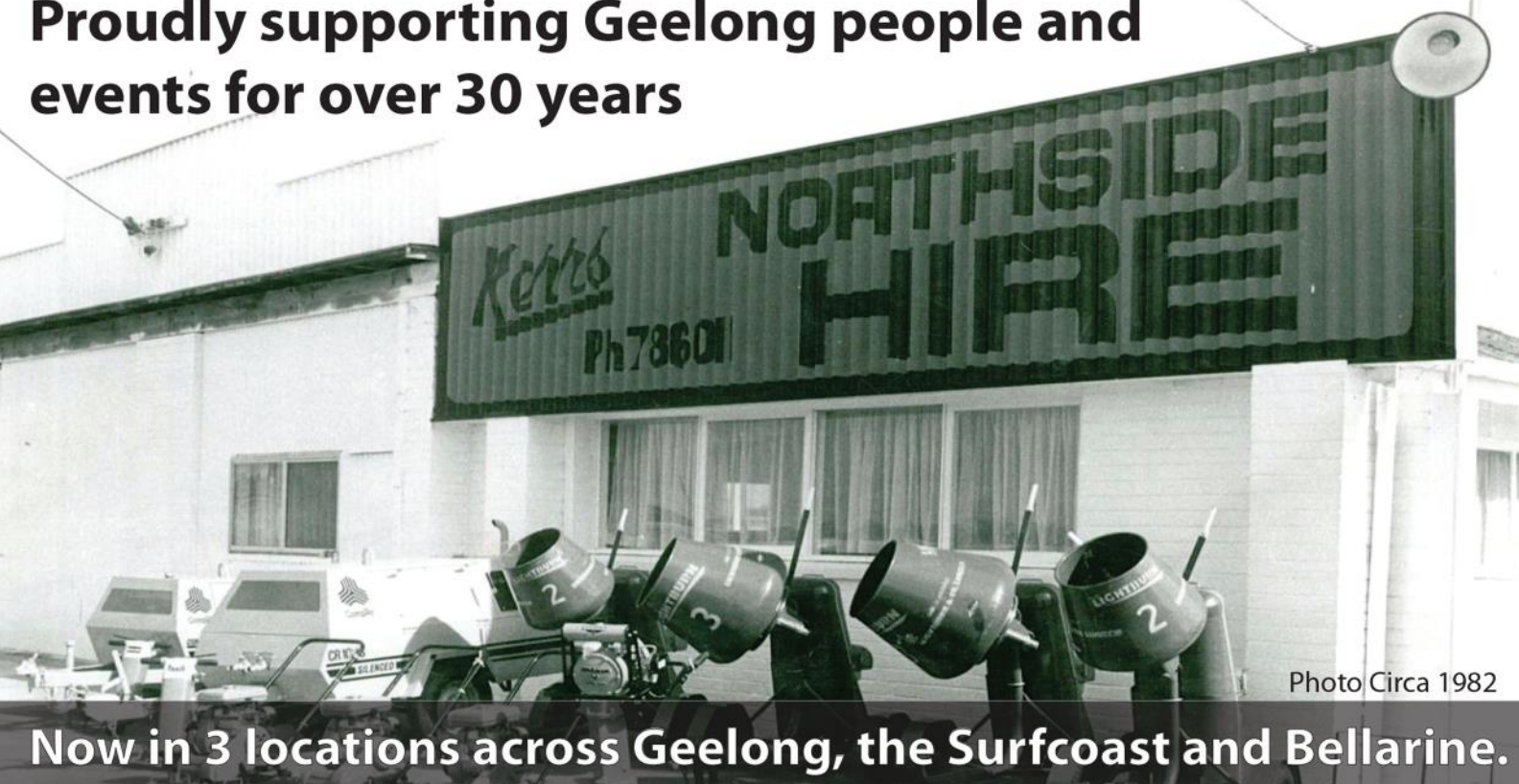
Photo Circa 1982

Proudly supporting Geelong people and events for over 30 years