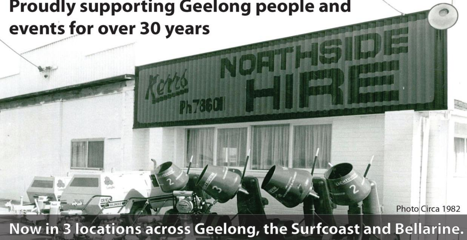
Photo Circa 1982

Proudly supporting Geelong people and events for over 30 years