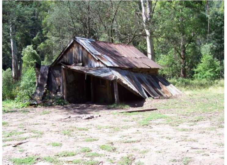
Original Upper Jamieson