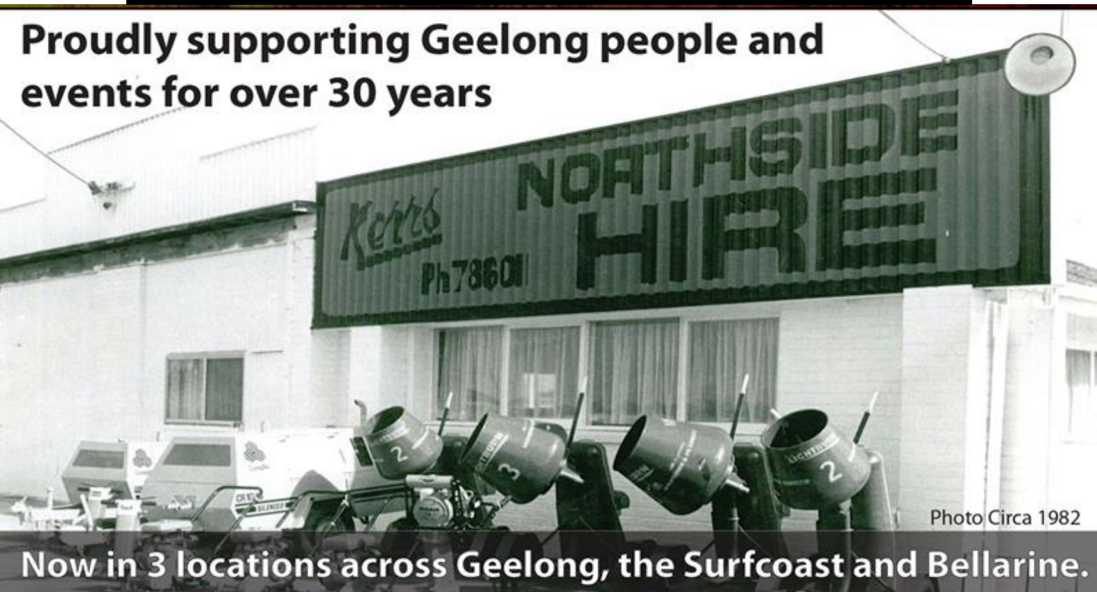
Photo Circa 1982

Proudly supporting Geelong people and events for over 30 years