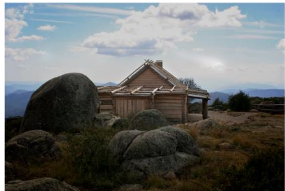
Craig's Hut Rebuilt