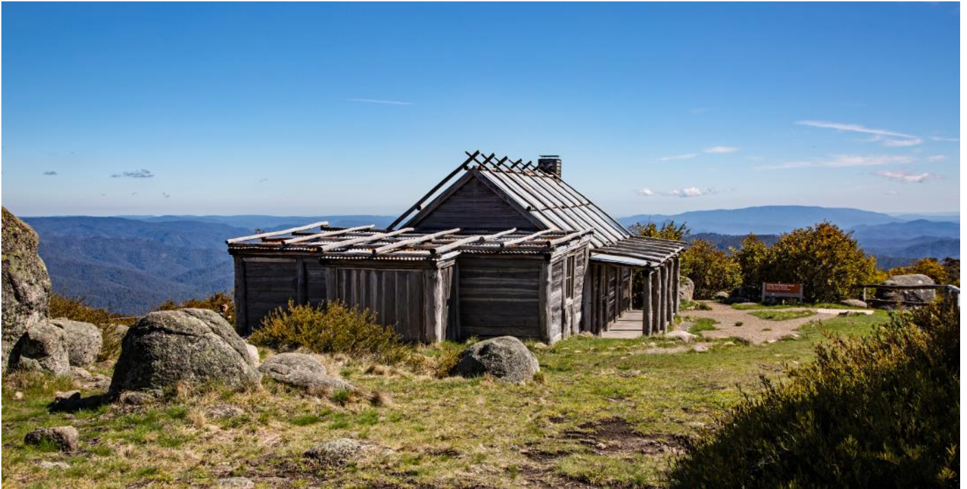
Craig's Hut Before Fires of 2006