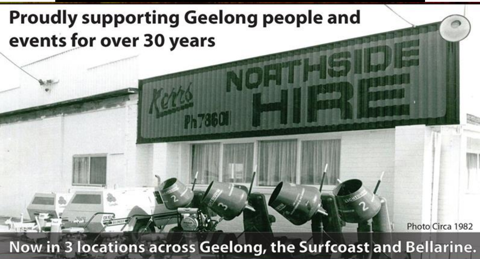
Photo Circa 1982

Proudly supporting Geelong people and events for over 30 years