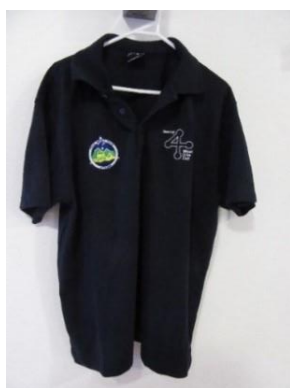
Polo Shirt $33.00

Head on in and try on your size – in the Navy Blue only, produce your club ID card and place your order with the logos on and then pick up when ready. All prices include embroidery.