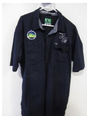
Good Shirt $64.95