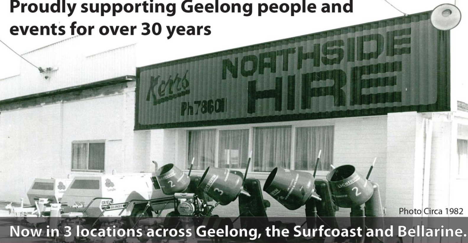
Photo Circa 1982

Proudly supporting Geelong people and events for over 30 years