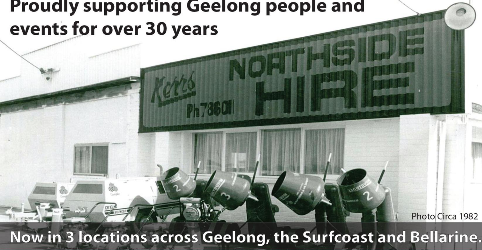
Photo Circa 1982

Proudly supporting Geelong people and events for over 30 years