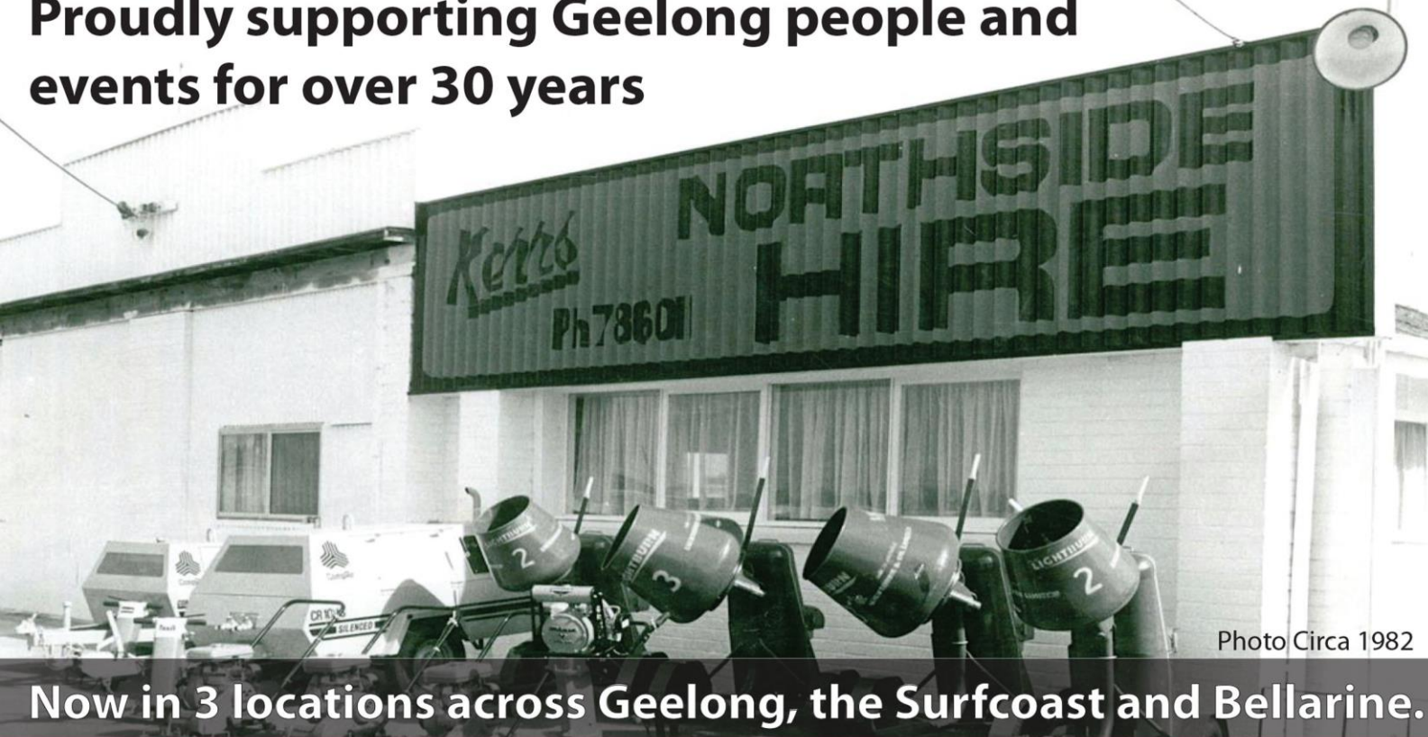
Photo Circa 1982

Proudly supporting Geelong people and events for over 30 years